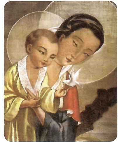
VIRGIN AND CHILD, ASIA (ARTIST UNKNOWN)

Recall, too, that Jesus and his disciples spoke Aramaic, and there is no equivalent for the meaning of "cousins" as we know it in that language. Instead, the word for brother or sister was used when referring to cousins. Thus, when St. Jerome ( circa 340–420) translated the Bible from Hebrew into Church Latin, he considered "the brothers of Jesus" as cousins, not siblings. After all, it would have been the rightful responsibility of these male relatives of Jesus to take care of Mary when Jesus died. Yet Jesus entrusts his mother to the care of his beloved disciple John (John 19:26). ●